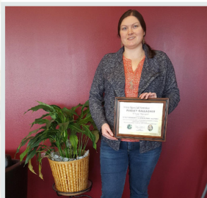
Special Service Paisley Gallagher Kitsap Harvest